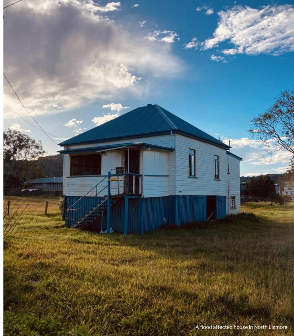
A flood affected house in North Lismore